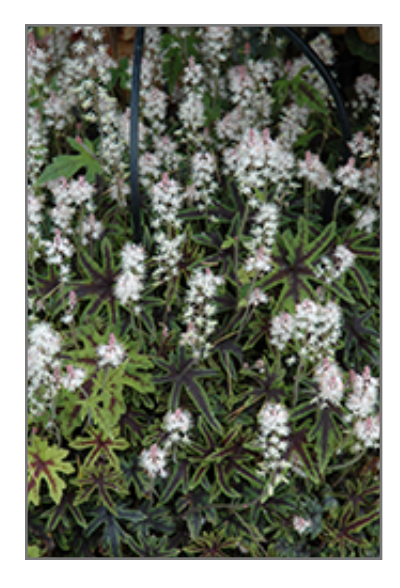
Cascade Creeper Foamflower flowers

This is a relatively low maintenance plant, and is best cleaned up in early spring before it resumes active growth for the season. Deer don't particularly care for this plant and will usually leave it alone in favor of tastier treats. It has no significant negative characteristics.