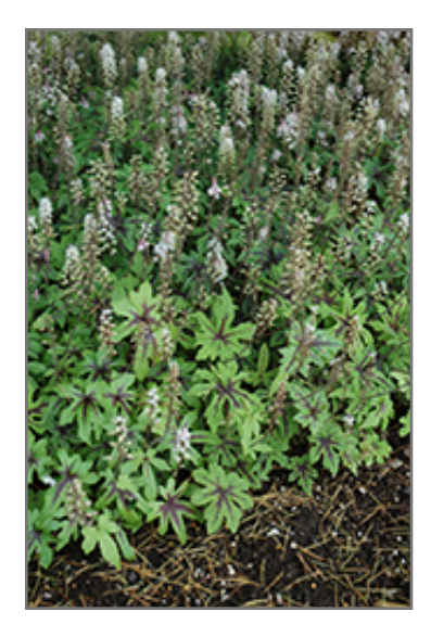
Cascade Creeper Foamflower in bloom