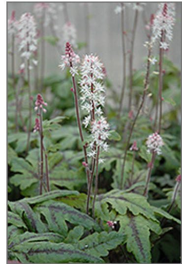
Candy Striper Foamflower flowers

Candy Striper Foamflower is recommended for the following landscape applications;