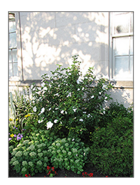
Diana Rose of Sharon in bloom