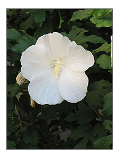
Diana Rose of Sharon flowers