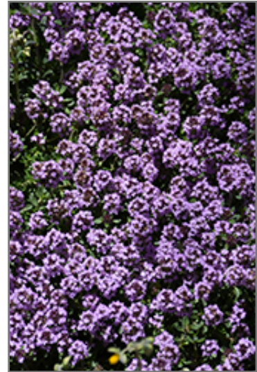
Pink Chintz Creeping Thyme flowers