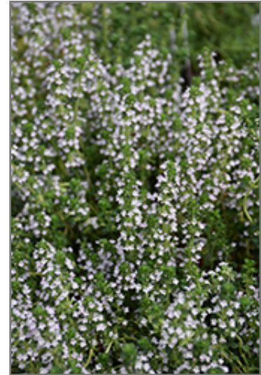
Doone Valley Thyme flowers

This plant will require occasional maintenance and upkeep, and is best cleaned up in early spring before it resumes active growth for the season. Deer don't particularly care for this plant and will usually leave it alone in favor of tastier treats. Gardeners should be aware of the following characteristic(s) that may warrant special consideration;