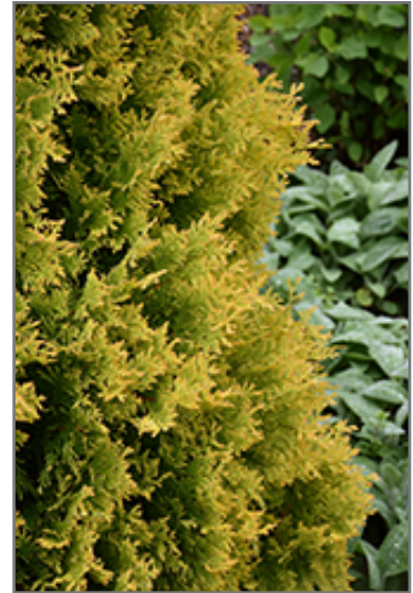
Gold Drop Arborvitae foliage

This shrub does best in full sun to partial shade. It prefers to grow in average to moist conditions, and shouldn't be allowed to dry out. It is not particular as to soil type or pH. It is somewhat tolerant of urban pollution, and will benefit from being planted in a relatively sheltered location. Consider applying a thick mulch around the root zone in winter to protect it in exposed locations or colder microclimates. This is a selection of a native North American species.