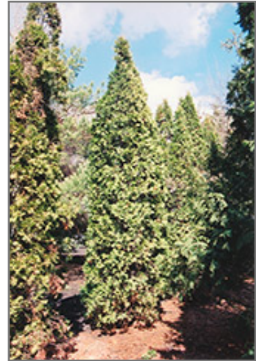
Pyramidal Arborvitae