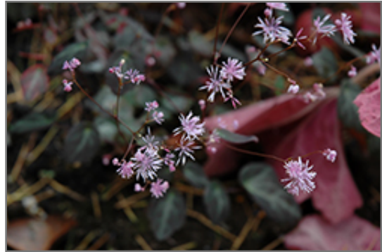
Evening Star Meadow Rue flowers