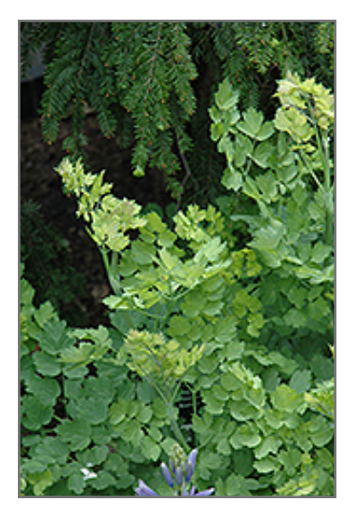
Illuminator Meadow Rue foliage

A fantastic selection from a very fine species with columns of steely blue foliage arising in spring, turning to a glaucous green; stately stems topped with bright yellow-green flowers in early summer; lovely massed along borders; will readily naturalize