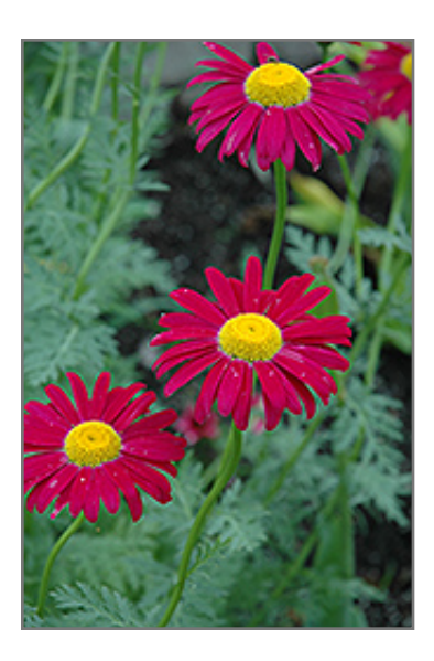
Robinson's Red Painted Daisy flowers