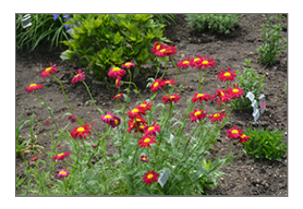
Robinson's Red Painted Daisy in bloom

Robinson's Red Painted Daisy will grow to be about 12 inches tall at maturity extending to 18 inches tall with the flowers, with a spread of 18 inches. When grown in masses or used as a bedding plant, individual plants should be spaced approximately 14 inches apart. It grows at a fast rate, and under ideal conditions can be expected to live for approximately 5 years. As an herbaceous perennial, this plant will usually die back to the crown each winter, and will regrow from the base each spring. Be careful not to disturb the crown in late winter when it may not be readily seen!