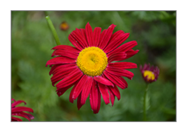
Robinson's Red Painted Daisy flowers

This is a relatively low maintenance plant, and should be cut back in late fall in preparation for winter. It is a good choice for attracting butterflies to your yard, but is not particularly attractive to deer who tend to leave it alone in favor of tastier treats. It has no significant negative characteristics.