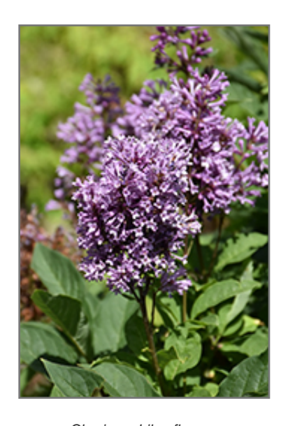
Charisma Lilac flowers

This is a relatively low maintenance shrub, and should only be pruned after flowering to avoid removing any of the current season's flowers. It is a good choice for attracting butterflies to your yard. It has no significant negative characteristics.