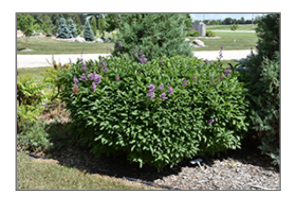
Charisma Lilac in bloom

Charisma Lilac is recommended for the following landscape applications;