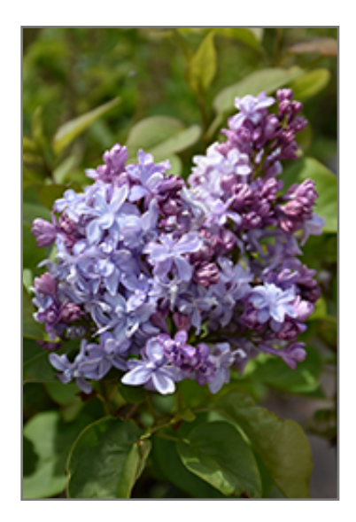
Nadezhda Lilac flowers

Nadezhda Lilac is recommended for the following landscape applications;