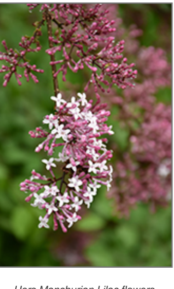
Hers Manchurian Lilac flowers

This is a relatively low maintenance shrub, and should only be pruned after flowering to avoid removing any of the current season's flowers. It is a good choice for attracting butterflies to your yard. It has no significant negative characteristics.