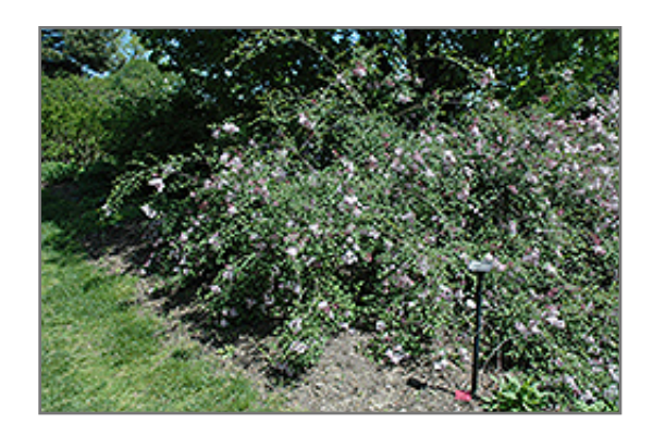
Hers Manchurian Lilac in bloom

Hers Manchurian Lilac is recommended for the following landscape applications;