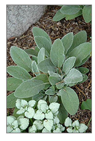
Fuzzy Wuzzy Lamb's Ears foliage

Fuzzy Wuzzy Lamb's Ears is a dense herbaceous evergreen perennial with a mounded form. Its relatively coarse texture can be used to stand it apart from other garden plants with finer foliage.