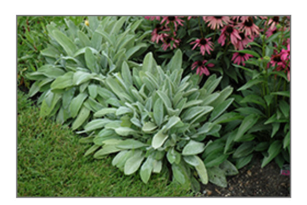
Fuzzy Wuzzy Lamb's Ears

This is a high maintenance plant that will require regular care and upkeep, and should only be pruned after flowering to avoid removing any of the current season's flowers. It is a good choice for attracting bees to your yard, but is not particularly attractive to deer who tend to leave it alone in favor of tastier treats. Gardeners should be aware of the following characteristic(s) that may warrant special consideration: