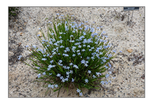
Narrowleaf Blue-Eyed Grass in bloom

This is a high maintenance plant that will require regular care and upkeep, and should only be pruned after flowering to avoid removing any of the current season's flowers. It is a good choice for attracting butterflies and hummingbirds to your yard, but is not particularly attractive to deer who tend to leave it alone in favor of tastier treats. Gardeners should be aware of the following characteristic(s) that may warrant special consideration;