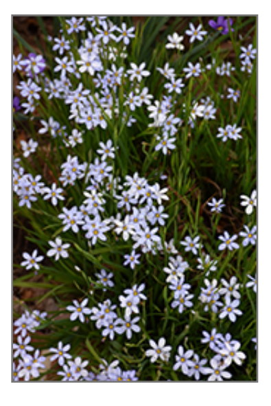
Narrowleaf Blue-Eyed Grass flowers

Narrowleaf Blue-Eyed Grass is an herbaceous perennial with an upright spreading habit of growth. Its medium texture blends into the garden, but can always be balanced by a couple of finer or coarser plants for an effective composition.