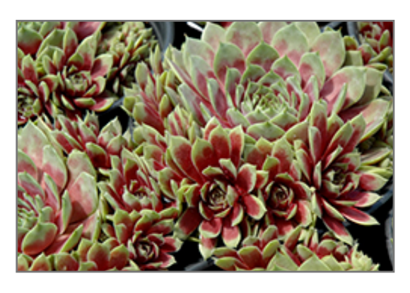
Commander Hay Hens And Chicks

Commander Hay is the perfect hardy, drought tolerant succulent for rock gardens; this variety produces dusty gray-green leaves that develop into deep red with green tips for a stunning display of colour; a lovely low addition to containers