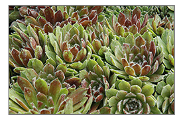
Ashes of Roses Hens And Chicks

Ashes of Roses Hens And Chicks is recommended for the following landscape applications;