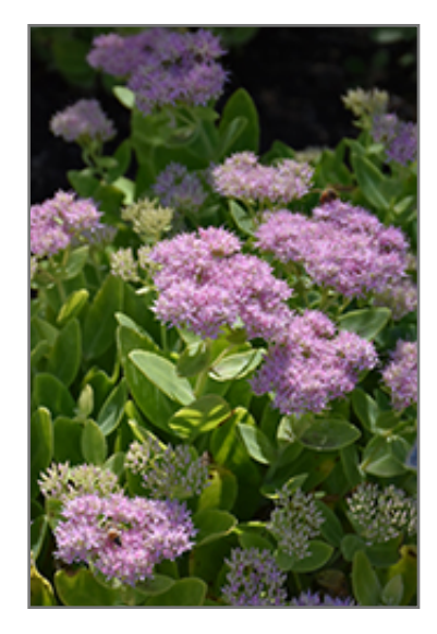
Crystal Pink Stonecrop flowers

Crystal Pink Stonecrop is a dense herbaceous perennial with an upright spreading habit of growth. Its relatively coarse texture can be used to stand it apart from other garden plants with finer foliage.