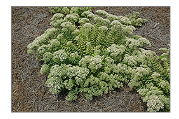
Crystal Pink Stonecrop in bloom