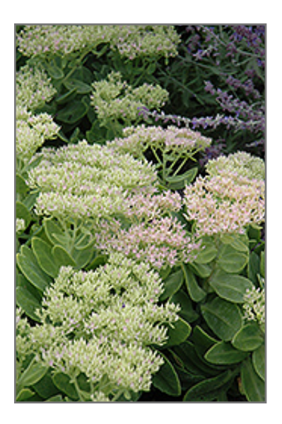
Crystal Pink Stonecrop flowers

Crystal Pink Stonecrop is a fine choice for the garden, but it is also a good selection for planting in outdoor pots and containers. It is often used as a 'filler' in the 'spiller-thriller-filler' container combination, providing a mass of flowers against which the larger thriller plants stand out. Note that when growing plants in outdoor containers and baskets, they may require more frequent waterings than they would in the yard or garden. Be aware that in our climate, most plants cannot be expected to survive the winter if left in containers outdoors, and this plant is no exception. Contact our experts for more information on how to protect it over the winter months.