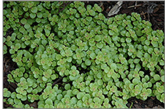
Golden Stonecrop

Golden Stonecrop will grow to be only 1 inch tall at maturity extending to 2 inches tall with the flowers, with a spread of 12 inches. When grown in masses or used as a bedding plant, individual plants should be spaced approximately 10 inches apart. Its foliage tends to remain low and dense right to the ground. It grows at a medium rate, and under ideal conditions can be expected to live for approximately 10 years. As an evergreen perennial, this plant will typically keep its form and foliage year-round.