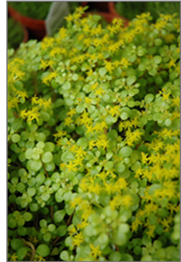
Golden Stonecrop flowers

Golden Stonecrop is recommended for the following landscape applications;