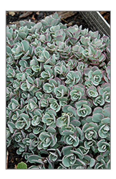
Japanese Stonecrop foliage

This Japanese native is perfect for the rock garden; a compact species with stunning blue-green foliage, pink stems and bears mounds of fuchsia toned flowers in fall; perfect for massed presentations and containers