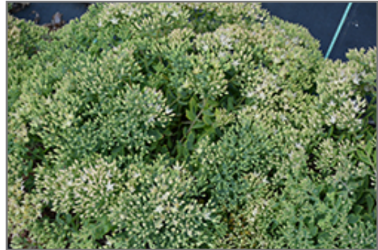
Thundercloud Stonecrop flower buds