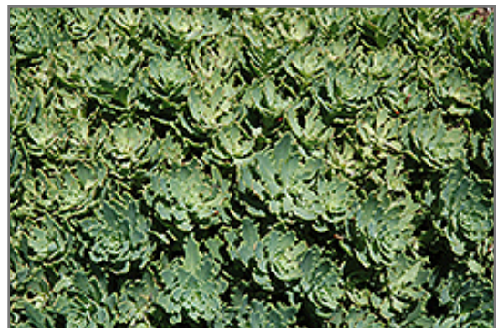
Thundercloud Stonecrop