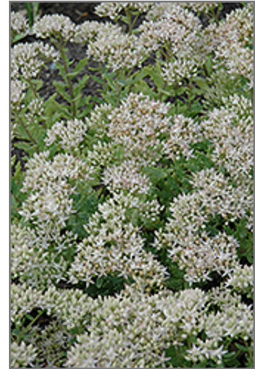
Thundercloud Stonecrop flowers

Thundercloud Stonecrop is a dense herbaceous perennial with a mounded form. Its relatively fine texture sets it apart from other garden plants with less refined foliage.