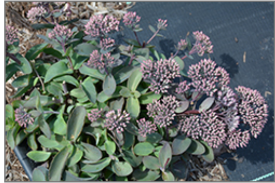
Chocolate Drop Stonecrop flower buds