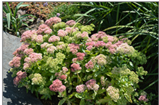
Autumn Delight Stonecrop in bloom