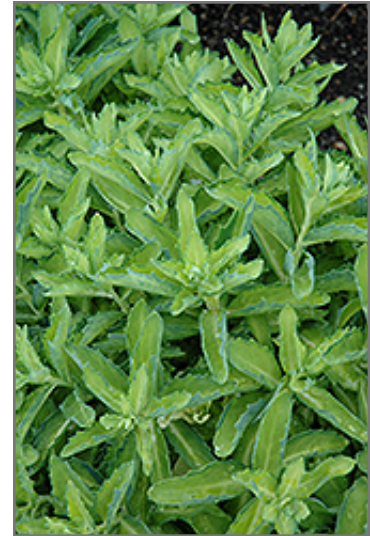
Autumn Delight Stonecrop foliage

Autumn Delight Stonecrop is a fine choice for the garden, but it is also a good selection for planting in outdoor pots and containers. It is often used as a 'filler' in the 'spiller-thriller-filler' container combination, providing a mass of flowers and foliage against which the larger thriller plants stand out. Note that when growing plants in outdoor containers and baskets, they may require more frequent waterings than they would in the yard or garden. Be aware that in our climate, most plants cannot be expected to survive the winter if left in containers outdoors, and this plant is no exception. Contact our experts for more information on how to protect it over the winter months.