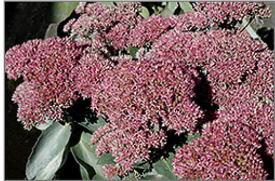
Autumn Delight Stonecrop flowers

Autumn Delight Stonecrop is a dense herbaceous perennial with an upright spreading habit of growth. Its relatively coarse texture can be used to stand it apart from other garden plants with finer foliage.