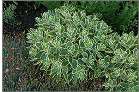
Autumn Charm Stonecrop