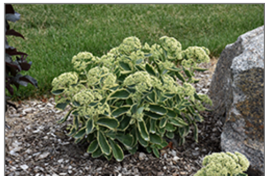
Autumn Charm Stonecrop in bloom