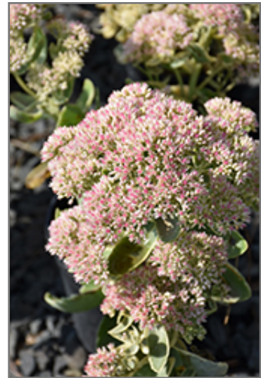
Autumn Charm Stonecrop flowers

Autumn Charm Stonecrop is a dense herbaceous perennial with an upright spreading habit of growth. Its relatively coarse texture can be used to stand it apart from other garden plants with finer foliage.