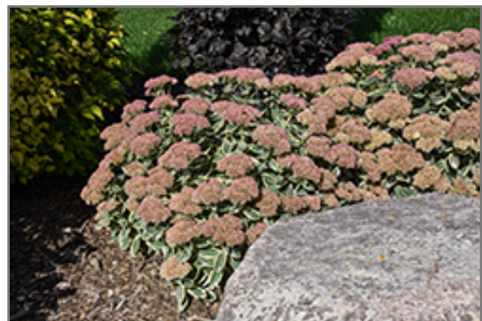
Autumn Charm Stonecrop in bloom