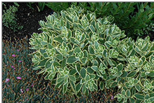
Autumn Charm Stonecrop