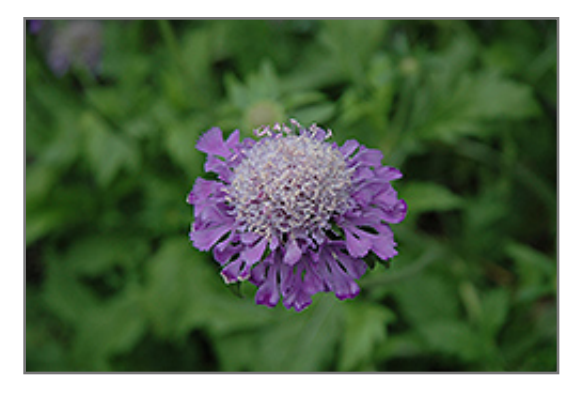
Mongolian Mist Pincushion Flower flowers