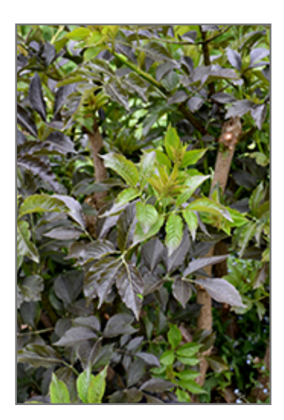
Thundercloud Elder foliage

This shrub does best in full sun to partial shade. It is quite adaptable, prefering to grow in average to wet conditions, and will even tolerate some standing water. It is not particular as to soil type or pH. It is highly tolerant of urban pollution and will even thrive in inner city environments. This is a selected variety of a species not originally from North America.