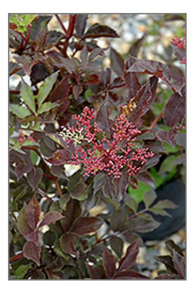
Thundercloud Elder flowers

This is a high maintenance shrub that will require regular care and upkeep, and is best pruned in late winter once the threat of extreme cold has passed. It is a good choice for attracting birds to your yard. Gardeners should be aware of the following characteristic(s) that may warrant special consideration;