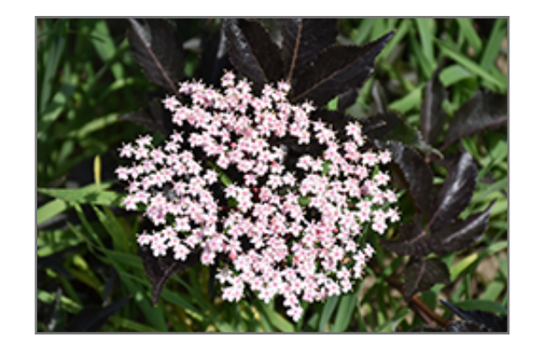
Thundercloud Elder flowers