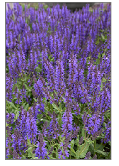
Viola Klose Sage flowers

A brilliant favorite whith its spiky violet-blue flowers which are much deeper and more intense in color than any other perennial salvia; the compact foliage is aromatic when crushed; proven to be an outstanding performer on the landscape