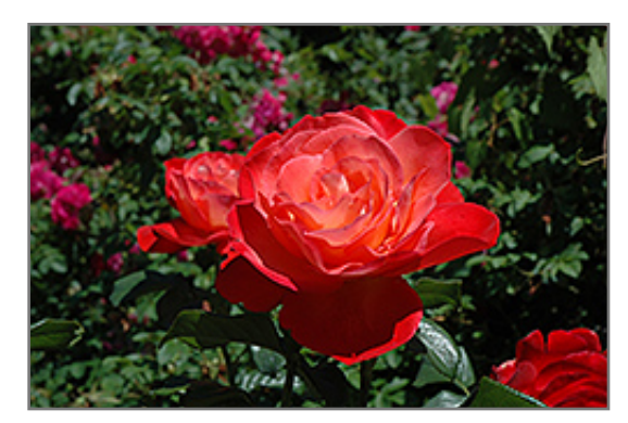
Touch of Class Rose flowers