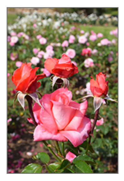
Touch of Class Rose flowers

This shrub will require occasional maintenance and upkeep, and is best pruned in late winter once the threat of extreme cold has passed. Gardeners should be aware of the following characteristic(s) that may warrant special consideration;