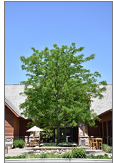
Skyline Honeylocust

Skyline Honeylocust will grow to be about 45 feet tall at maturity, with a spread of 35 feet. It has a high canopy of foliage that sits well above the ground, and should not be planted underneath power lines. As it matures, the lower branches of this tree can be strategically removed to create a high enough canopy to support unobstructed human traffic underneath. It grows at a fast rate, and under ideal conditions can be expected to live for 70 years or more.