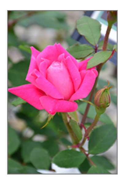
Pink Double Knock Out Rose flowers

Pink Double Knock Out Rose is recommended for the following landscape applications;