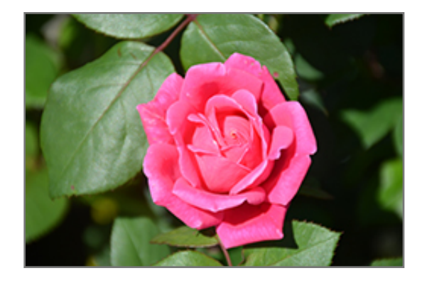
Pink Double Knock Out Rose flowers

A bright pink version of the Double Knock Out rose that is stable and unfazed by heat; classic shaped flowers from spring to the first frost; a vibrant color that will perk up any landscape, it is also tough, vigorous and disease resistant