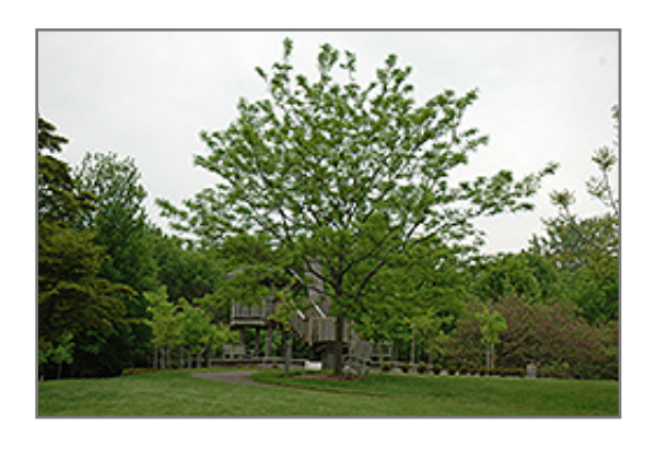
Imperial Honeylocust

This is a relatively low maintenance tree, and is best pruned in late winter once the threat of extreme cold has passed. Deer don't particularly care for this plant and will usually leave it alone in favor of tastier treats. It has no significant negative characteristics.