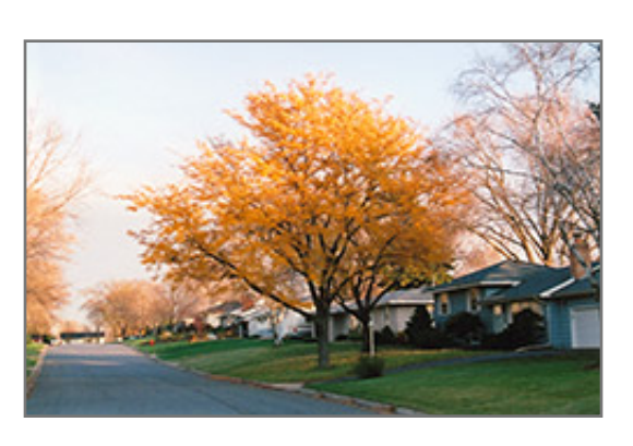
Imperial Honeylocust in fall

Imperial Honeylocust is recommended for the following landscape applications;