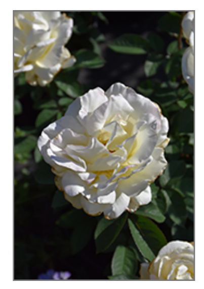
Garden Party Rose flowers