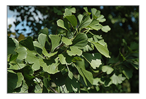
Princeton Sentry Ginkgo foliage