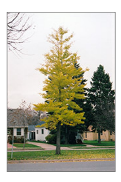
Princeton Sentry Ginkgo in fall

This tree should only be grown in full sunlight. It is very adaptable to both dry and moist locations, and should do just fine under average home landscape conditions. It is not particular as to soil type or pH, and is able to handle environmental salt. It is highly tolerant of urban pollution and will even thrive in inner city environments. Consider applying a thick mulch around the root zone in winter to protect it in exposed locations or colder microclimates. This is a selected variety of a species not originally from North America.