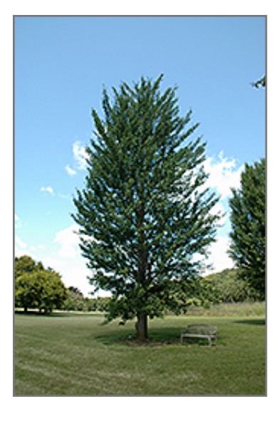
Princeton Sentry Ginkgo

Princeton Sentry Ginkgo is recommended for the following landscape applications;