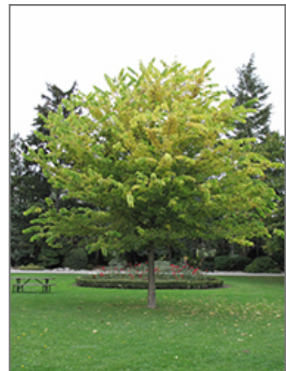
Common Hackberry in fall