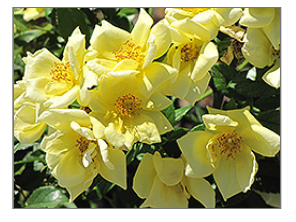
Flower Carpet Yellow Rose flowers

Flower Carpet Yellow Rose is covered in stunning fragrant semi-double yellow flowers with creamy white eves at the ends of the branches from late spring to late summer. The flowers are excellent for cutting. It has dark green deciduous foliage. The glossy oval compound leaves do not develop any appreciable fall colour.