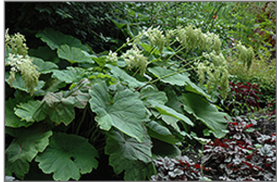
Shieldleaf Rodgersia in bloom