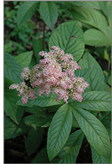
Chocolate Wings Rodgersia flowers