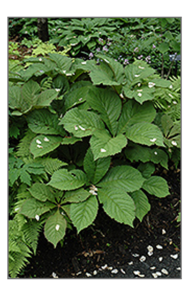
Big Mama Fingerleaf Rodgersia foliage

Resembling leaves of a horse-chestnut, this Chinese native requires a large area to grow and display its huge plumes of pink shaded flowers ranging in length from 18 to 24 inches over the these towering plants; one is an ideal specimen in the garden