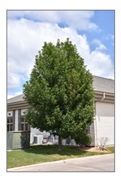
Patmore Green Ash