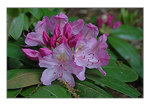
Roseum Superbum Rhododendron flowers

Captivating large blooms that range from lavender to pink with gold blotches, adorn this stately variety in mid spring; an accent or border shrub that will definitely command attention; absolutely must have well-drained, highly acidic and organic soil