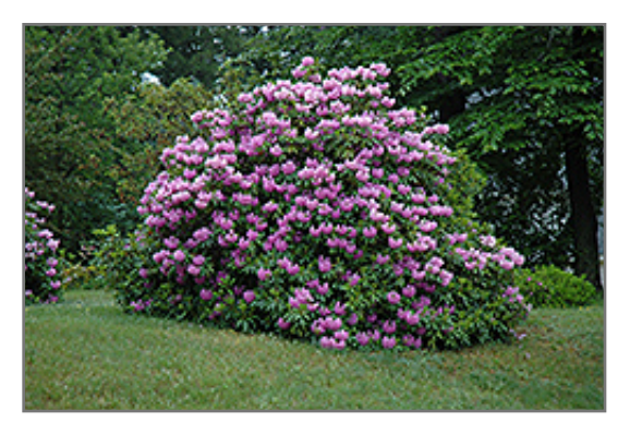
Grandiflorum Rhododendron in bloom