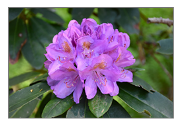
Grandiflorum Rhododendron flowers