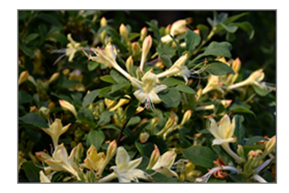
Weston's Lemon Drop Azalea flowers

Weston's Lemon Drop Azalea is recommended for the following landscape applications;