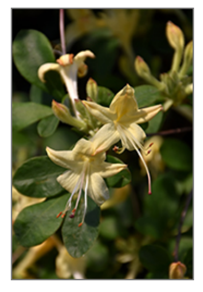
Weston's Lemon Drop Azalea flowers

This is a relatively low maintenance shrub, and should only be pruned after flowering to avoid removing any of the current season's flowers. It has no significant negative characteristics.