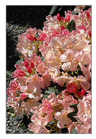
Percy Wiseman Rhododendron flowers

This is a relatively low maintenance shrub, and should only be pruned after flowering to avoid removing any of the current season's flowers. It has no significant negative characteristics.