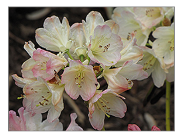
Percy Wiseman Rhododendron flowers

Percy Wiseman Rhododendron is recommended for the following landscape applications;