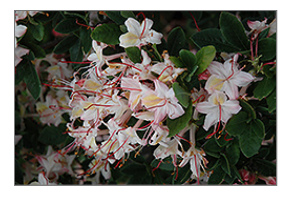
Lollipop Azalea flowers

Lollipop Azalea will grow to be about 3 feet tall at maturity, with a spread of 5 feet. It has a low canopy. It grows at a slow rate, and under ideal conditions can be expected to live for 40 years or more.