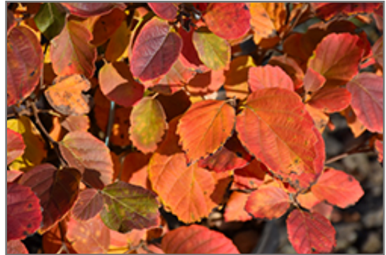
Mt. Airy Fothergilla in fall

This shrub does best in full sun to partial shade. It requires an evenly moist well-drained soil for optimal growth, but will die in standing water. It is not particular as to soil type, but has a definite preference for acidic soils, and is subject to chlorosis (yellowing) of the foliage in alkaline soils. It is somewhat tolerant of urban pollution. This is a selection of a native North American species.