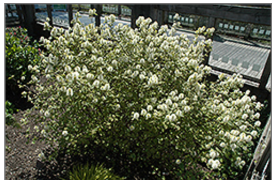
Mt. Airy Fothergilla in bloom