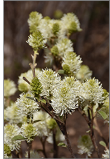
Mt. Airy Fothergilla flowers

Mt. Airy Fothergilla is recommended for the following landscape applications;