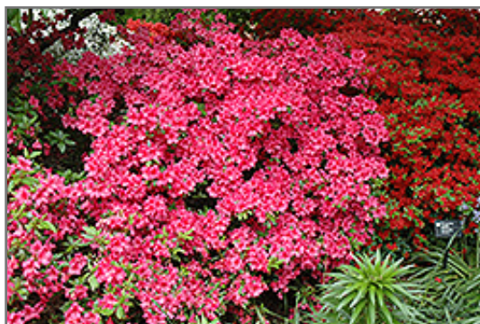
Girard's Rose Azalea in bloom