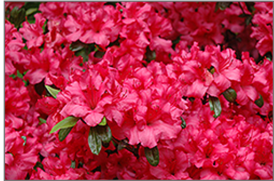
Girard's Rose Azalea flowers