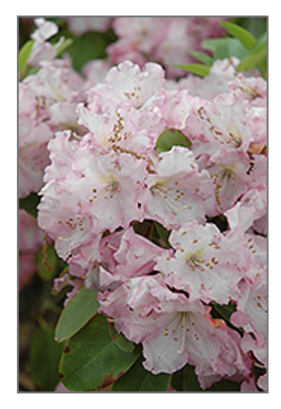
Dexter's Appleblossom Rhododendron flowers