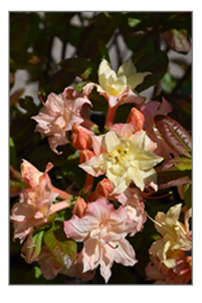
Cannon's Double Azalea flowers

This is a relatively low maintenance shrub, and should only be pruned after flowering to avoid removing any of the current season's flowers. It has no significant negative characteristics.