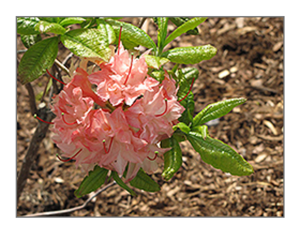
Cannon's Double Azalea flowers

Cannon's Double Azalea is recommended for the following landscape applications;