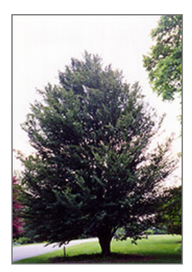
Roundleaf Beech