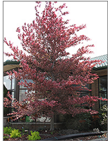
Tricolor Beech